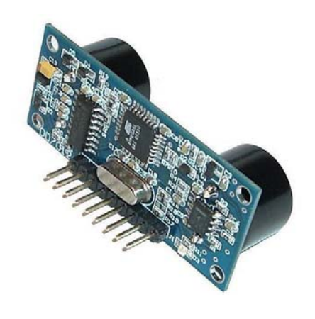
URM37 V3.2 Ultrasonic Sensor Manual